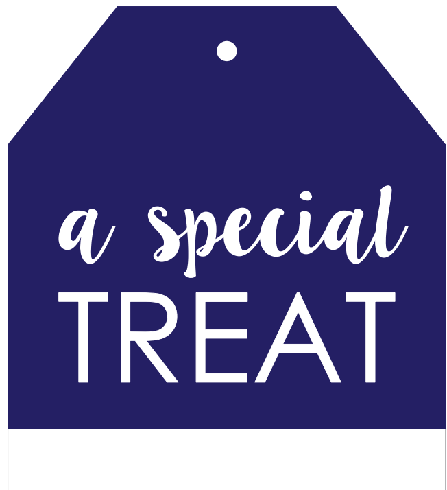
CUDDLE KIT ITEM TAGS