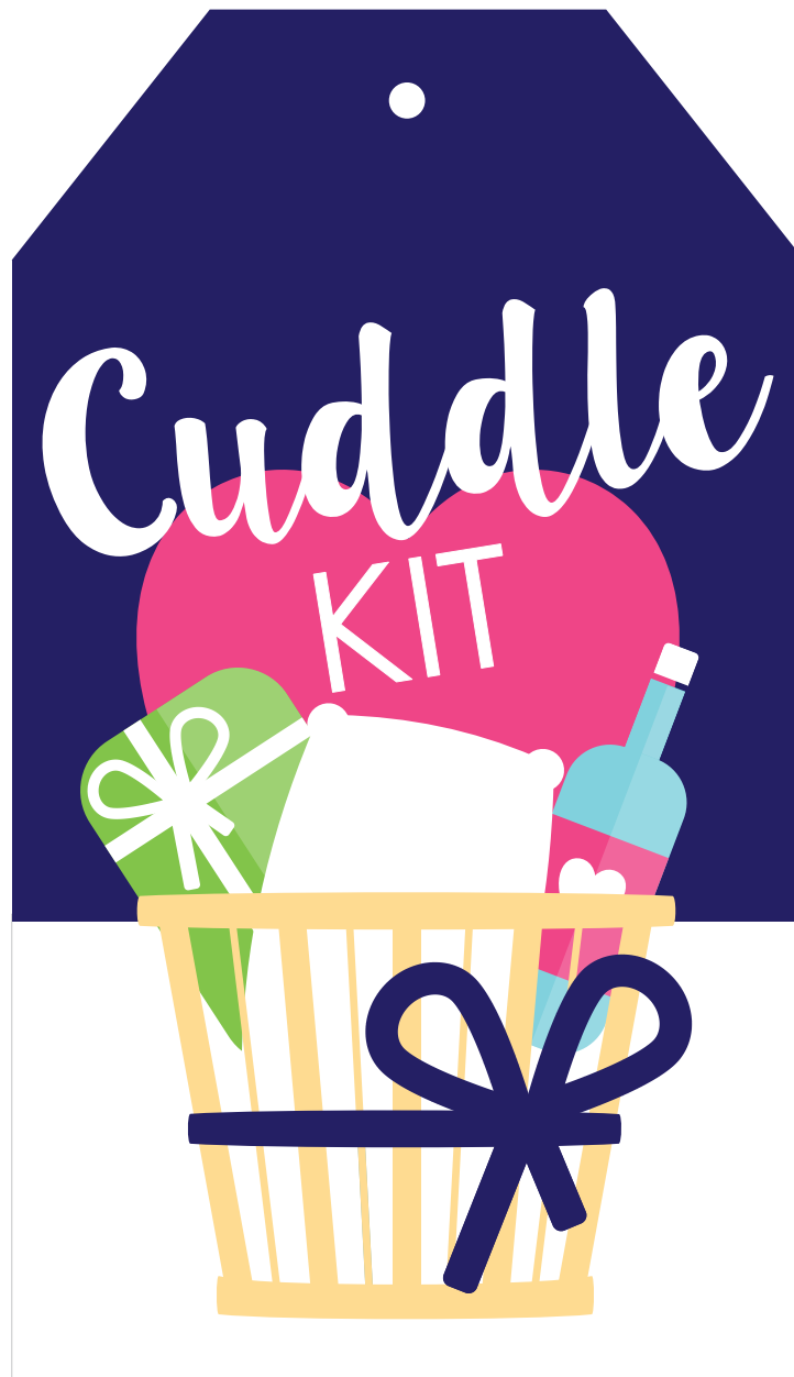
CUDDLE KIT GIFT TAG