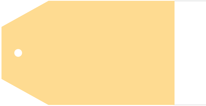
BLANK ITEM TAGS