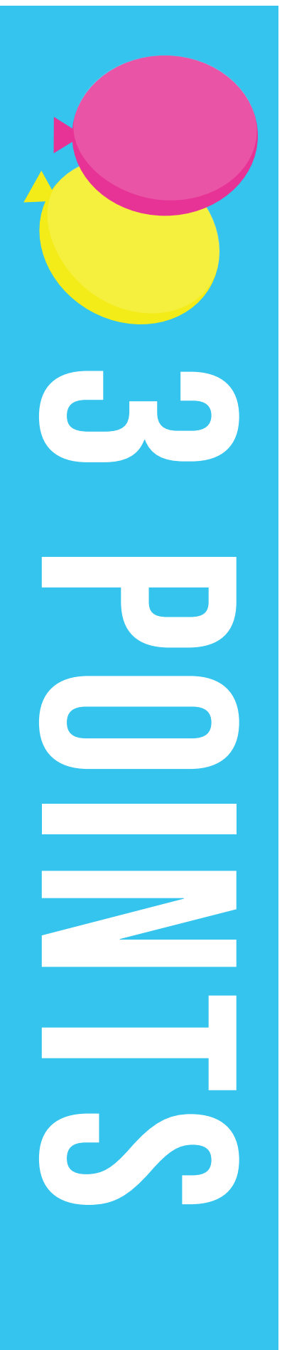
POINT LINE MARKERS