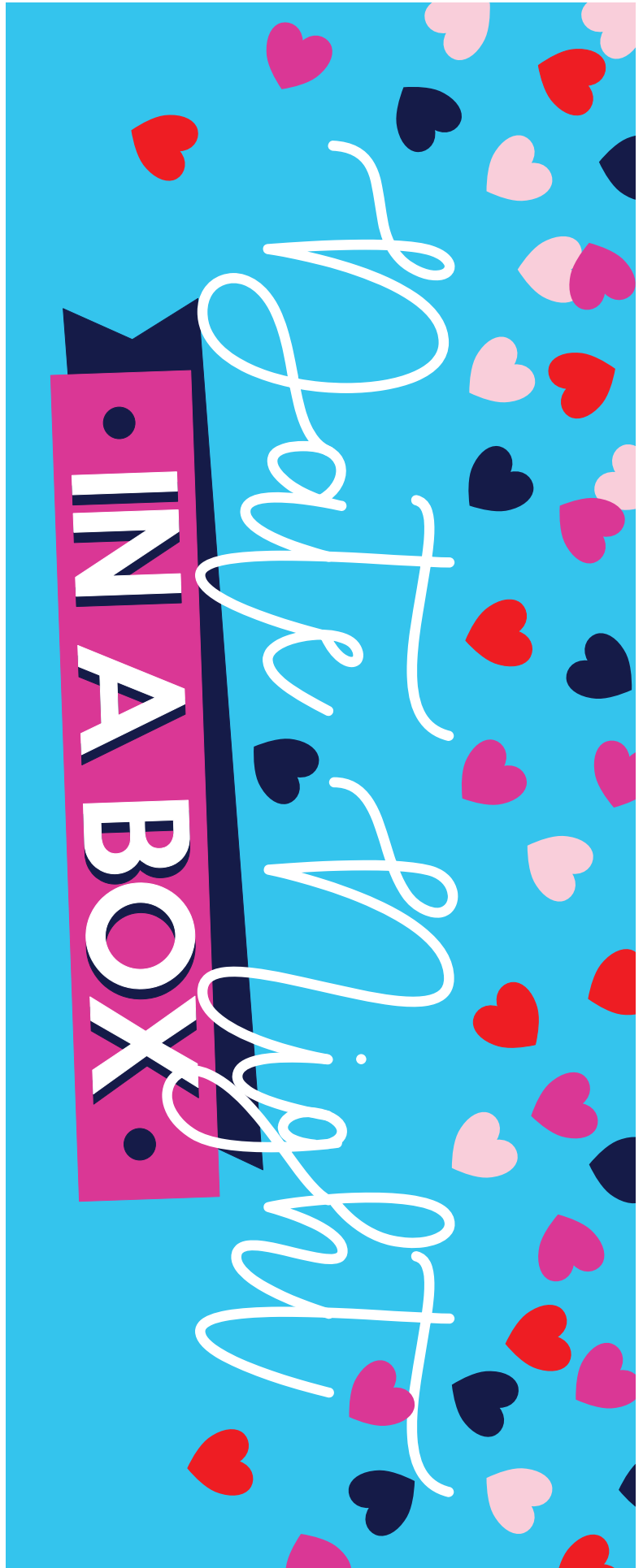
DECORATIVE FLAP PAPER