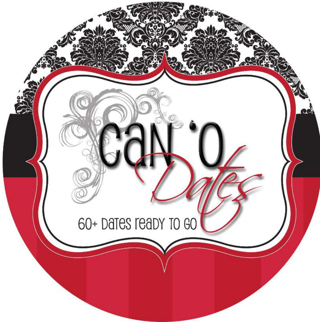
Label for the top of the can