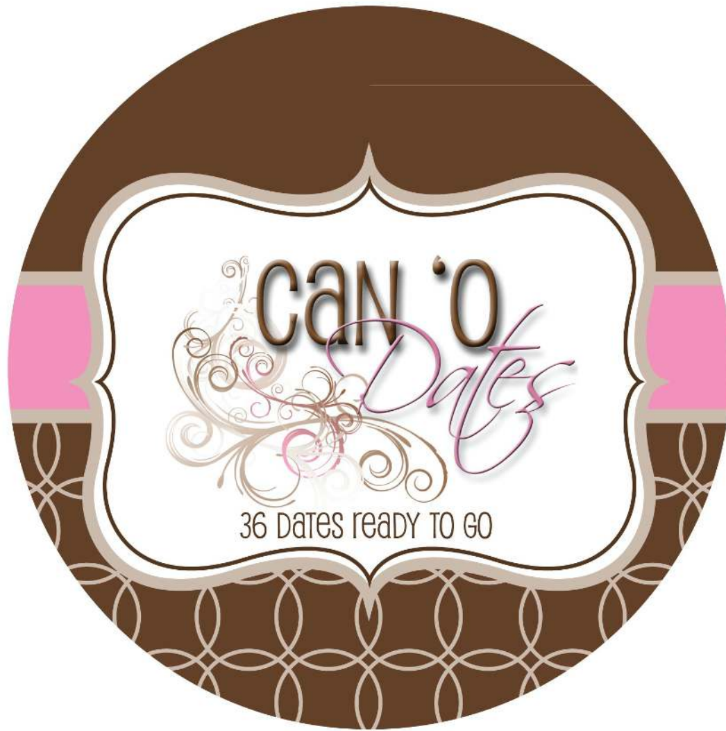
Label for the top of the can