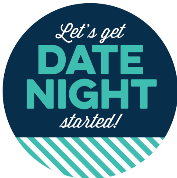
Jar Lid Label