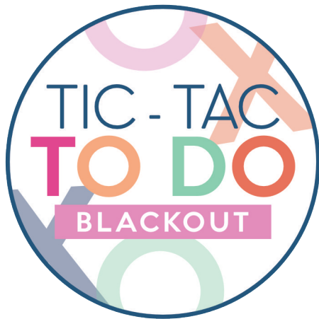
TIC TAC TO DO JAR LABELS

Work together with your spouse to decide on favors to add to the JAR for after you get a BLACKOUT. Once you get a blackout, draw a favor to cash in with your sweetheart! With our editable file it's all up to you and your spouse's wants and needs.