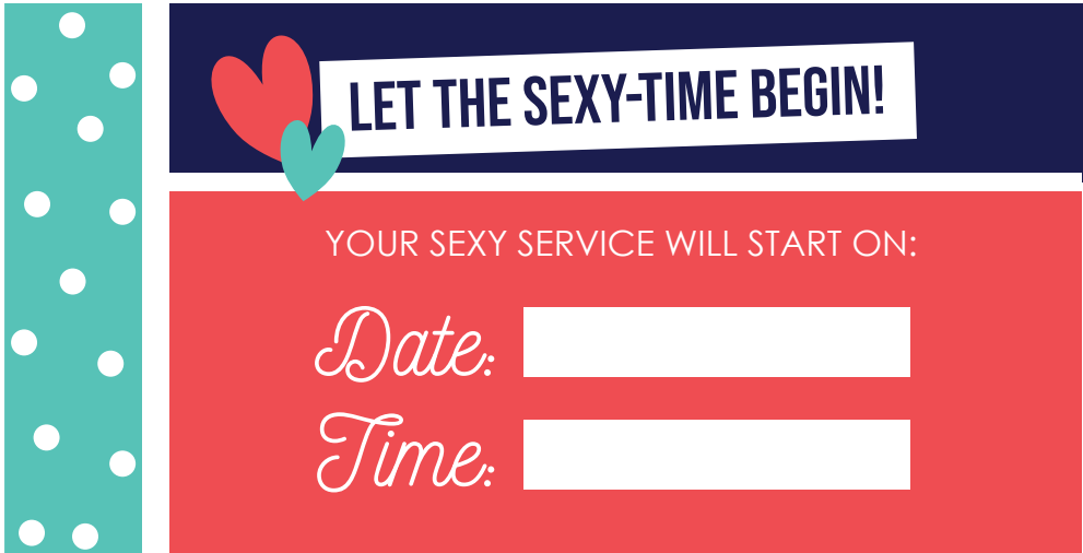
BONUS SEXY DATE/TIME CARD