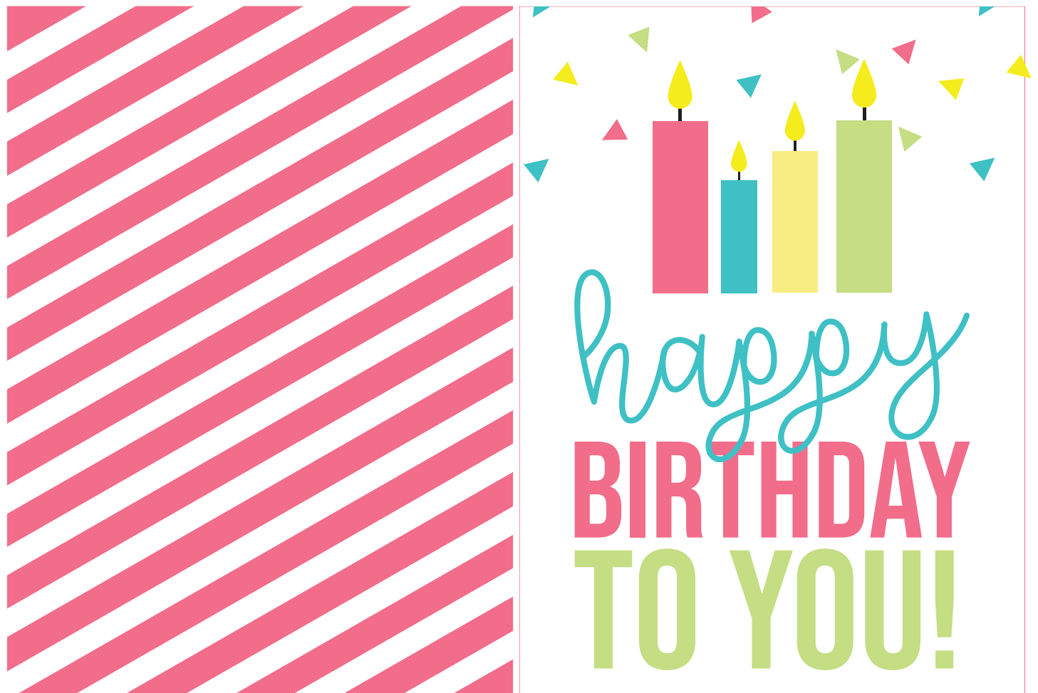
Birthday Breakfast Card