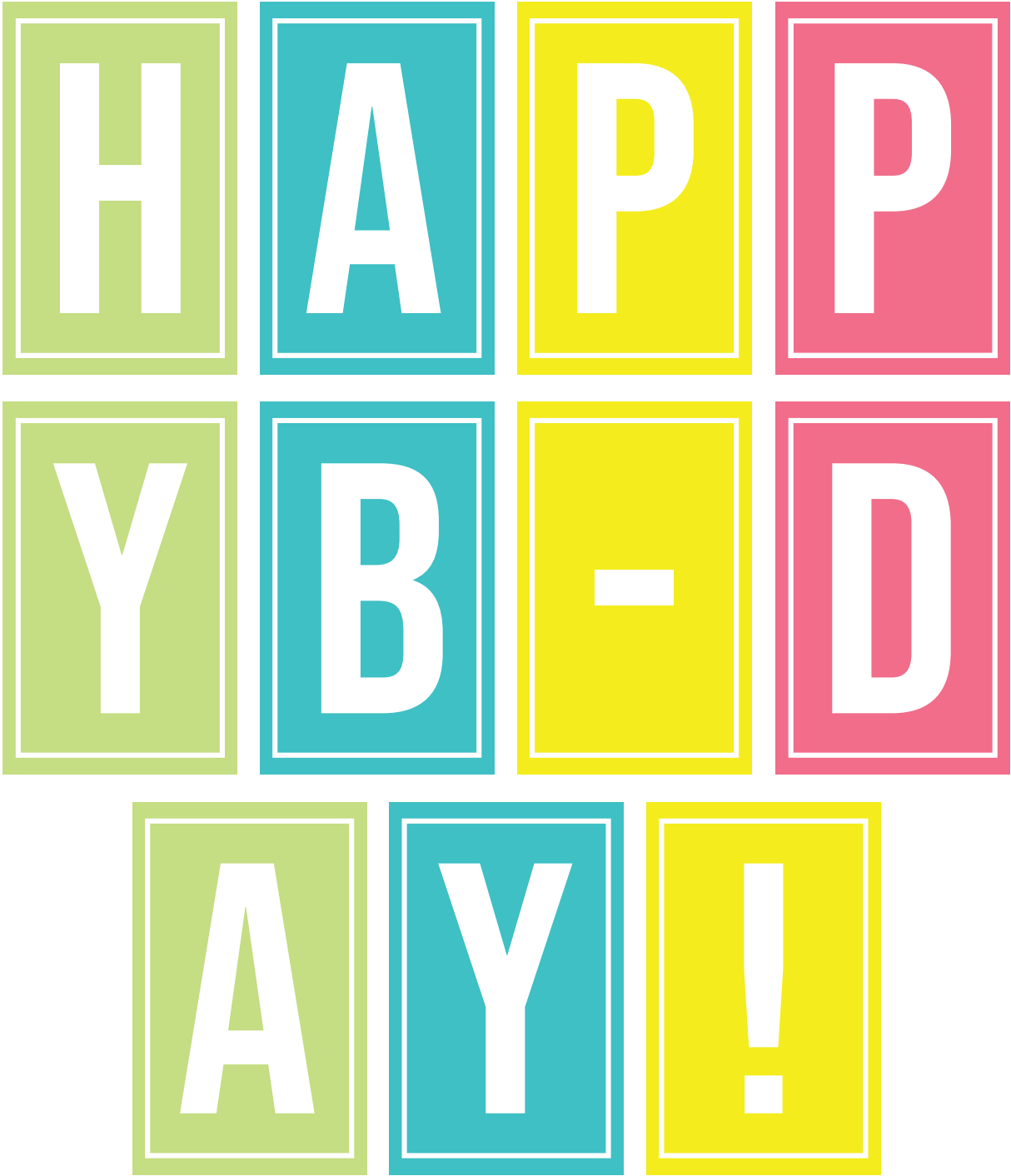
Birthday Mini Banner