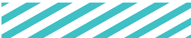
Birthday Breakfast Menu